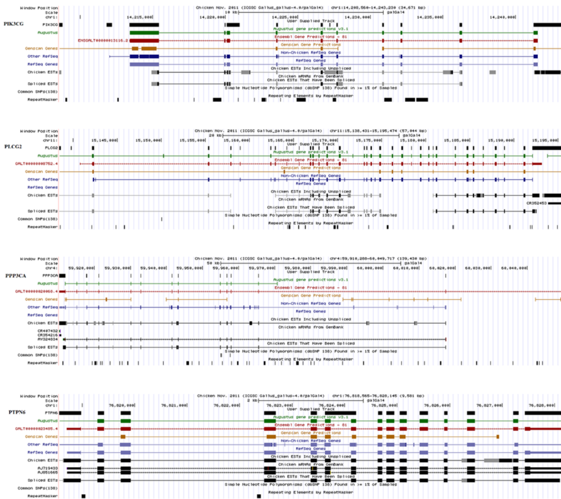
Figure3. Blast analysis showing alternative splicing. Splice variants identified in different expressed genes with novel isoform in Natural killer cell mediated cytotoxicity pathway after submission of transcripts assembled by Cuffcompare as custom tracks to UCSC genome browser.

It is also important to note that an aligner for RNA-Seq data should efficiently align reads matching to splice junctions (Li and Homer, 2010). Here, we used an efficient aligner, HISAT2, to identify differentially expressed isoforms as well as novel isoforms. Until now, identification and differential expression analysis of genes involved in immune system has not been reported by comparison between two different breeds in poultry. In our best knowledge, this is the first study to identify differentially expressed isoforms between two chicken breeds. However, the different studies were carried out on poultry which most of them emphasis on disease (Perumbakkam et al., 2013; Sandford, 2011; Wang et al., 2014).