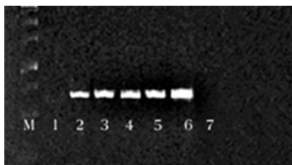
Figure 1. Sensitivity of S. Enteritidis detection; Lanes 1-6: PCR results from a serial of 10-fold dilutions prepared on buffered peptone water containing 10^0 to 10^5 CFU of S. Enteritidis . Lane 7: negative control. M: marker

PCR assay showed the 796 bp band in 38 samples (71%) indicating of contamination these samples with S. enterica . Gel electrophoresis analysis of PCR products performed on genomic DNA from commercial chicken skins, using primers aiming a DNA fragment of Salmonella spp. The codes on top of each lane correspond to the samples from local shops. Visualized bands indicate contamination of the samples with bacteria, and different rate shows different intensities (Figure 2).