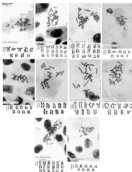
Figure 1. The mitotic metaphase samples and their karyotypes